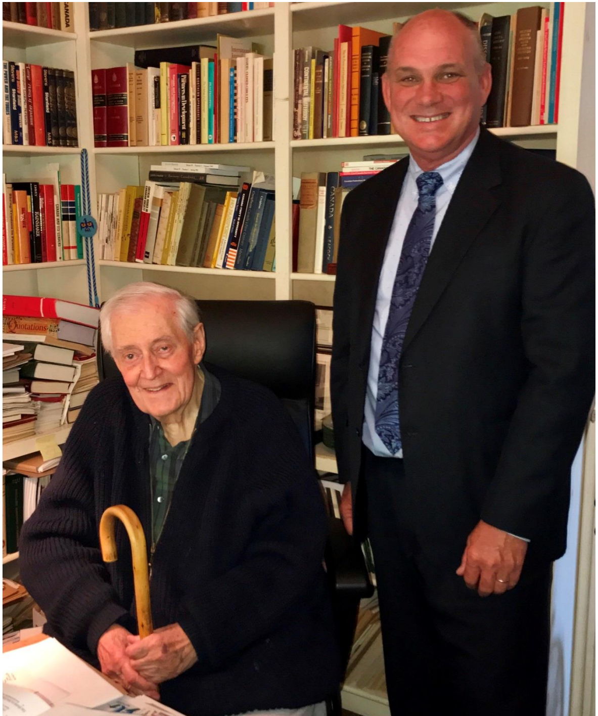
The Principal meets with the Founder and first Vice Chancellor of Trent University in Peterborough, Ontario, Canada..

For three months this year I was able to undertake a period of sabbatical leave visiting colleges and meeting with colleagues in the northern hemisphere. My report on this experience links our college's strategic plan to tangible initiatives for the future here that will have positive outcomes for our students.