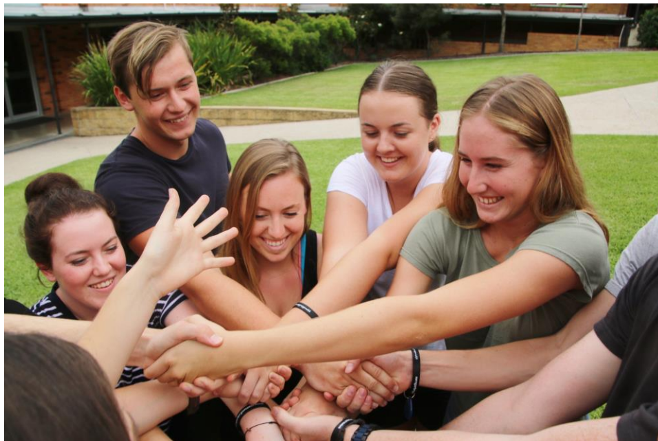
Fresher Sunday 2017