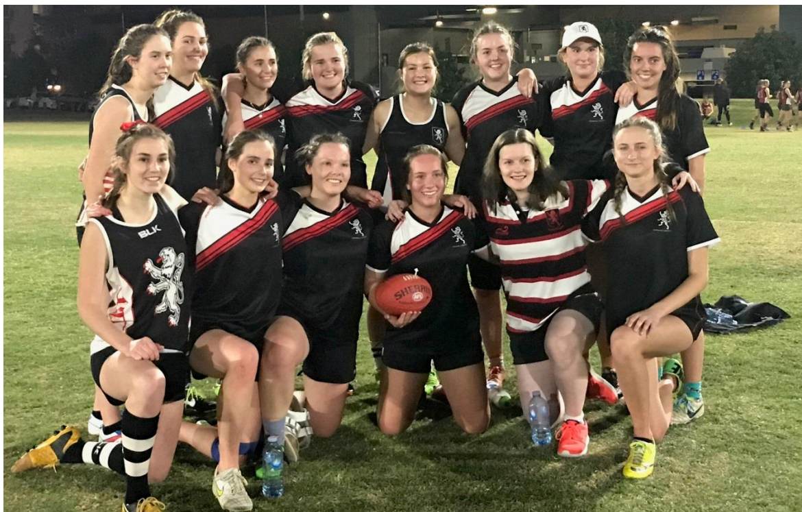
Cromwell's Girls' AFL team after reaching the final of the ICC Competition.